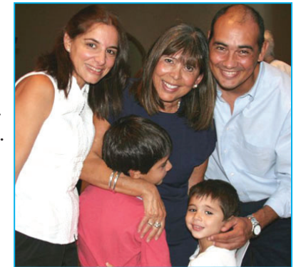
New co-member celebrates with friends in Kentucky.