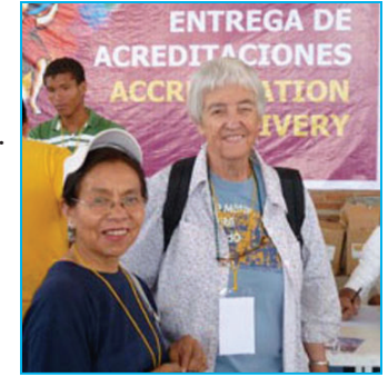
Loretto members attend conference in Bolivia.