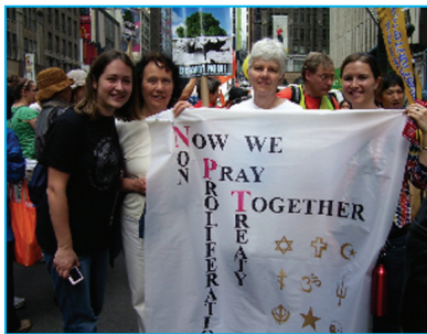
Loretto members at the United Nations demonstrate for the Non-Proliferation Treaty.