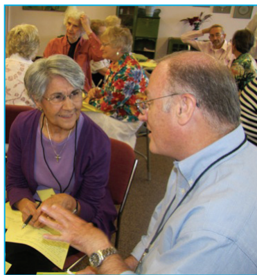
Loretto members take part in conversation circles in Denver.