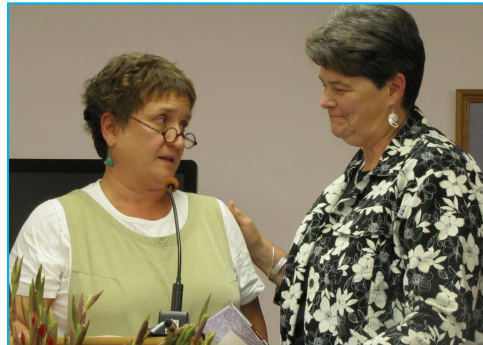
Loretto welcomes new co-member in Denver.