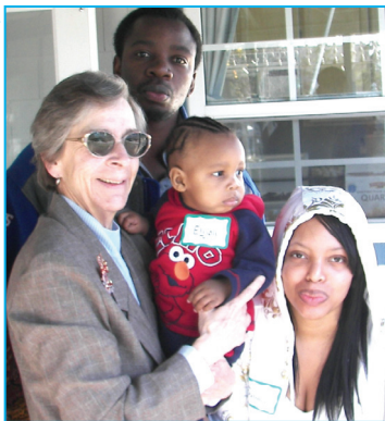
Co-member in California spends time with Haitian friends.