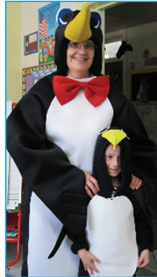
Loretto elementary principal in El Paso enjoys Halloween along with students.