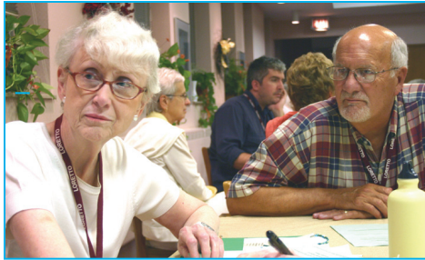
Co-members in St. Louis participate in discernment conversation.