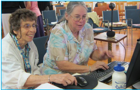
Loretto members in Kentucky link in by WebEx to community gathering.