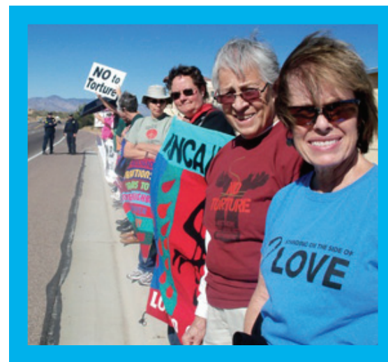
Loretto rallies for immigration reform in Arizona.