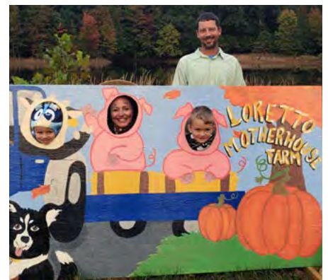
Visitors enjoy their time at the Loretto Motherhouse Farm.

Raises grass-fed beef and non-GMO grains using conservation practices, including intensive cover cropping, that keep a significant amount of carbon in the ground and out of the atmosphere. These regenerative farm practices are shared with others through farmer education events, the annual Ag Bash and group tours.