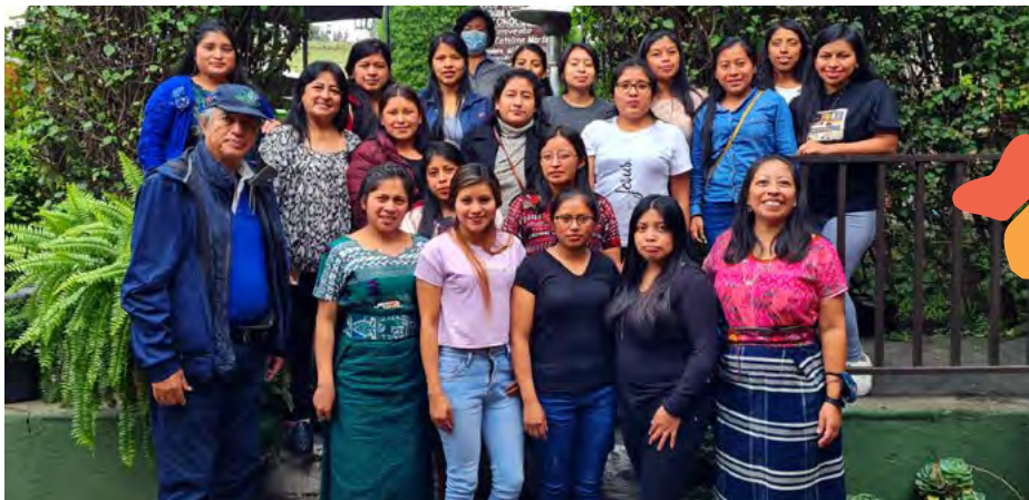
Quetzal Fund participants gather for a photo. The organization received a grant from the Loretto Community Carbon Reduction Fund.