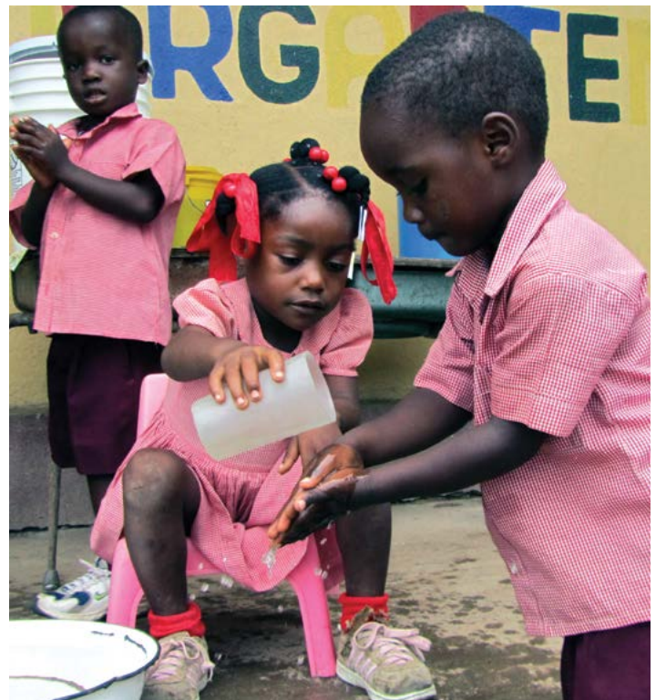
Children wash up in Haiti. See photos and an article about work being done in Haiti in the spring 2023 issue of Loretto Magazine.

Hunger Fund distributes aid to various organizations, as well as groups served by Loretto Community members