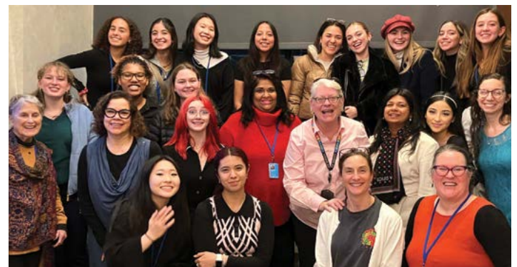
One of Loretto at the UN's most important activities has been participation at the annual U.N. Commission on the Status of Women, an international conference promoting girls' and women's rights. Students from St. Mary's Academy in Denver and Loretto Academy in El Paso regularly participate.

Where Funds Are Most Needed supports our mission and gives Loretto's leadership the flexibility to allocate funds as needed. Your confidence in our work is gratifying.