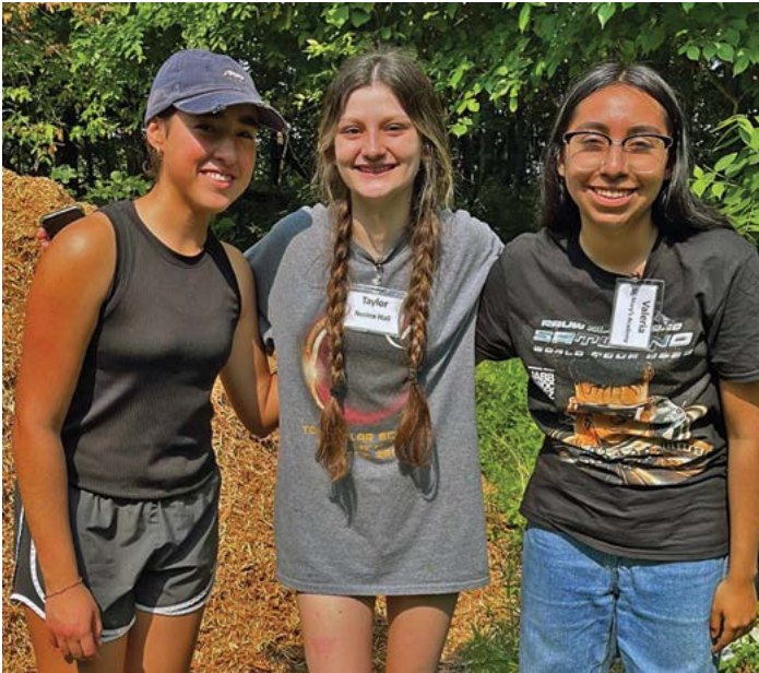
Volunteers take a break from spreading mulch. Students from Loretto Academy in El Paso, Nerinx Hall High School in St. Louis and St. Mary's Academy in Denver volunteered at the Loretto Motherhouse in June 2023.

Nerinx, Ky. In 2023 a new garden was planted behind the Living Center. Students from Loretto-affiliated high schools help with gardening during annual visits to the Motherhouse. See page 34 of this issue for more on this fund.