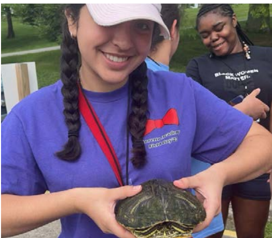
A Loretto Academy student volunteer holds a turtle at the Motherhouse.

Loretto Justice Fellowship sponsors undergraduate and graduate students at the University of Texas, El Paso, with paid social justice internships at organizations serving immigrants and others in need. The fellowship launched in 2023 with seven fellows and continues to grow. Community