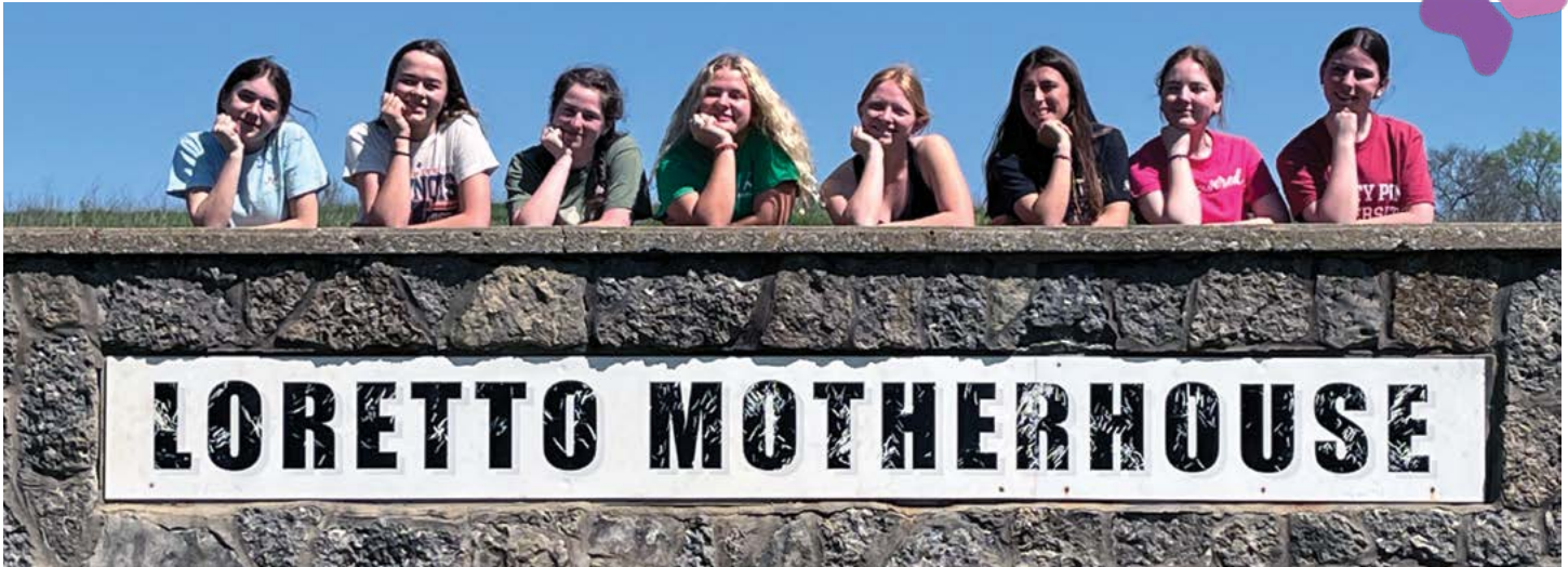
Nerinx Hall High School students from St. Louis volunteered at the Motherhouse, helping with many chores and delighting residents. Here they pose at the Motherhouse entrance.