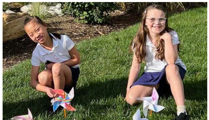
St. Mary's Academy students in Denver created pinwheels for peace, some of which were sent to the Motherhouse where they were planted by the peace pole.