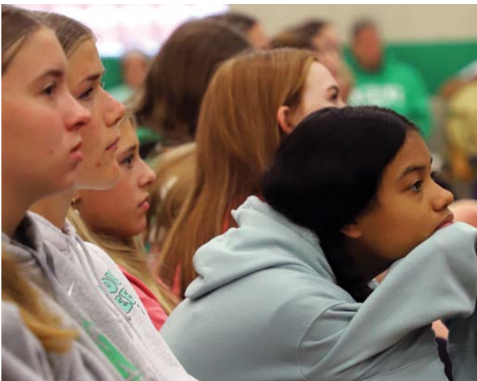
Students at Nerinx Hall High listen to presentations during the Loretto Foundation Day commemoration.

Where Funds Are Most Needed supports our mission and gives Loretto's leadership the flexibility to allocate funds as needed. Your confidence in our work is gratifying.