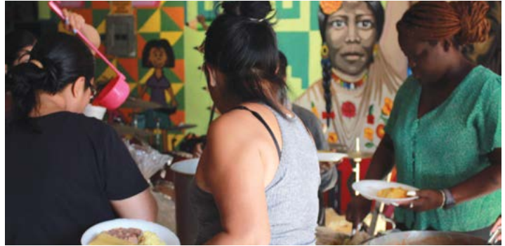
Espacio Migrante, a shelter in Tijuana, Mexico, has received funds from Loretto's Hunger Fund.