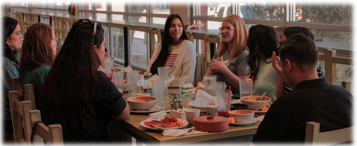
Loretto Justice Fellows gathered in-person and/or virtually 13 times between August 2024-May 2025 for community life programming. Gatherings included community meals, retreats and professional development sessions.