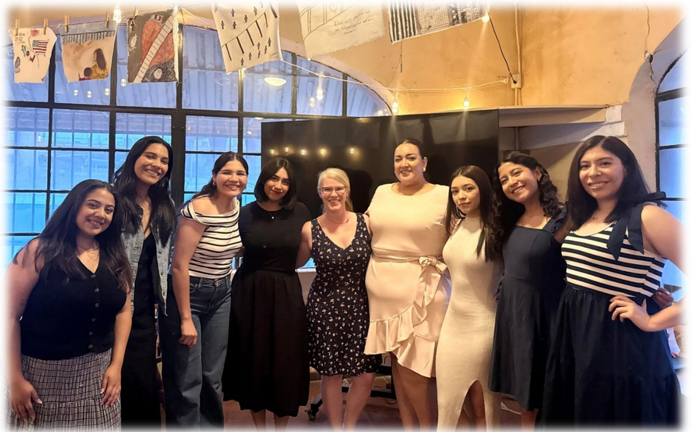
Former Fellows, all 2024-25 Fellows, representatives from all placement site partner organizations, university partners and Loretto Community members gathered for our End-of-Year Celebration. Fellows, family members, Loretto Community members and placement partners shared the impact of the program, celebrated our collective achievements and nourished ourselves for our journeys in justice ahead. (May 2025)